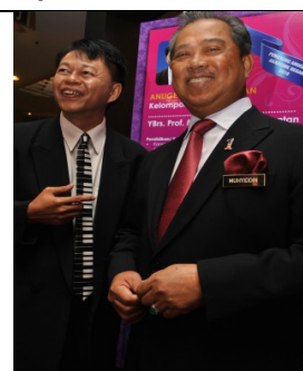
AAN Reception 2011 with the Deputy Prime Minister.

Addresses: Academic Management Development Division No2, Level 4, Tower 2, Jalan P5/6, Presint 5 62200, W.P. Putrajaya MALAYSIA